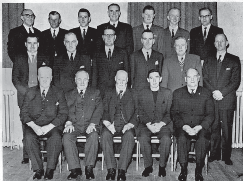
THE ELDERS WITH DATES OF ORDINATION